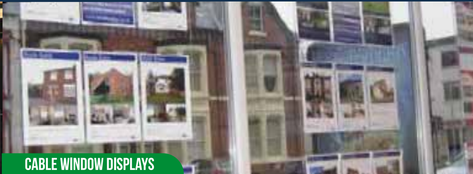
CABLE WINDOW DISPLAYS